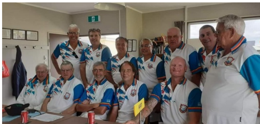
The Kapiti Coast men's team and management at the Octagonal tournament at the Central club.