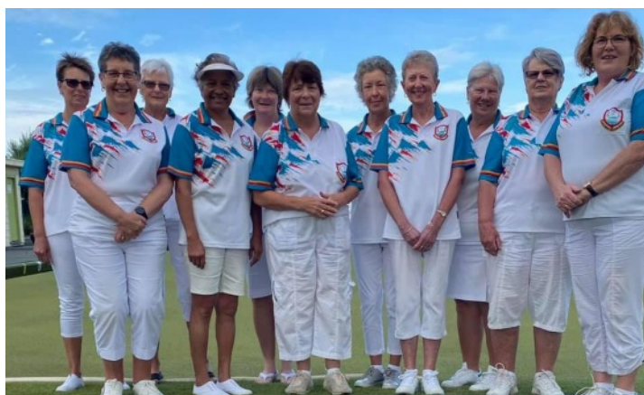
The Kapiti Coast Women's Hexagonal team.

Correspondence to the Centre should be addressed to: